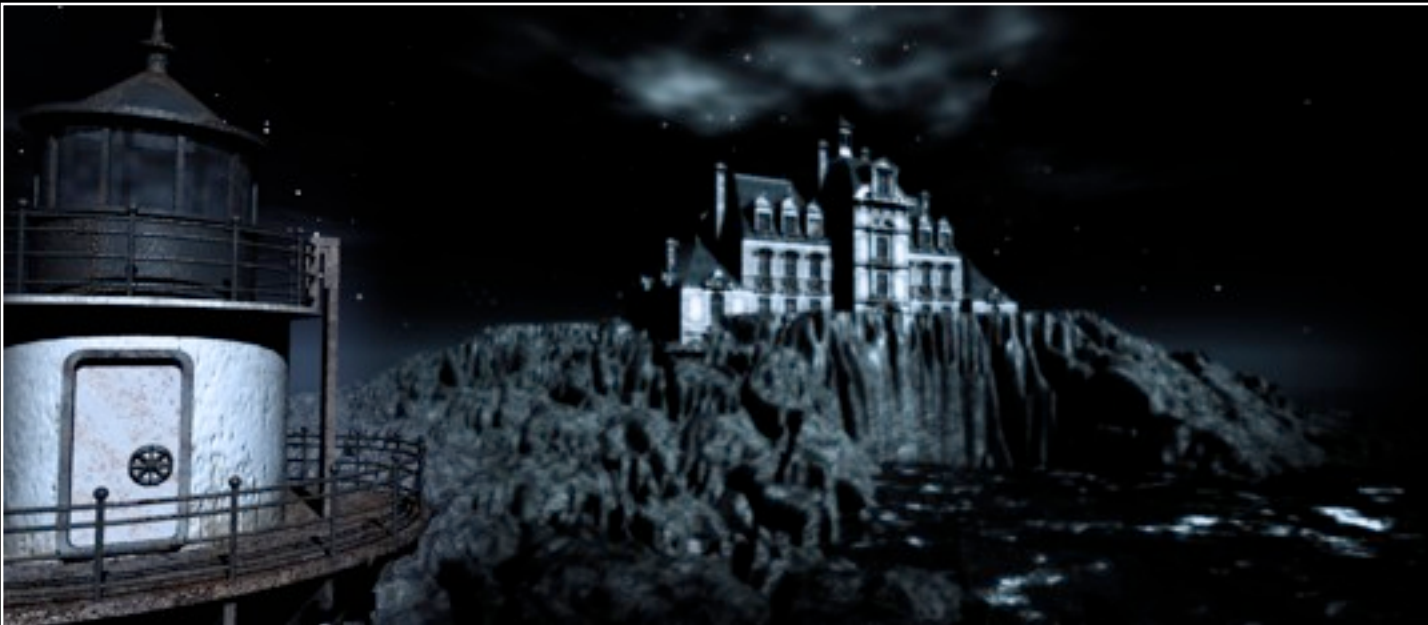
View of the mansion from the lighthouse at night. The lighthouse is strangely deserted and out of commission.