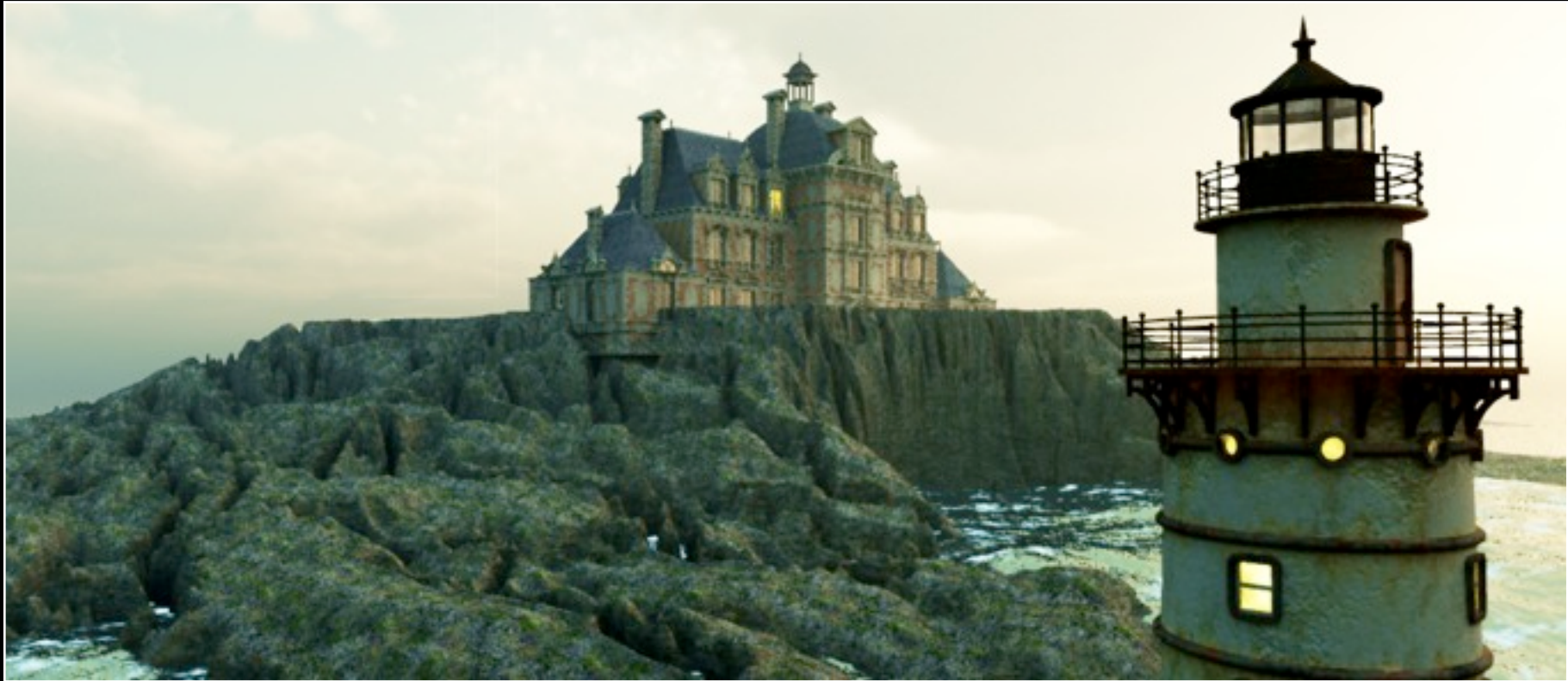
The morning after. The storm has passed and life on Moorhenge continues as normal...