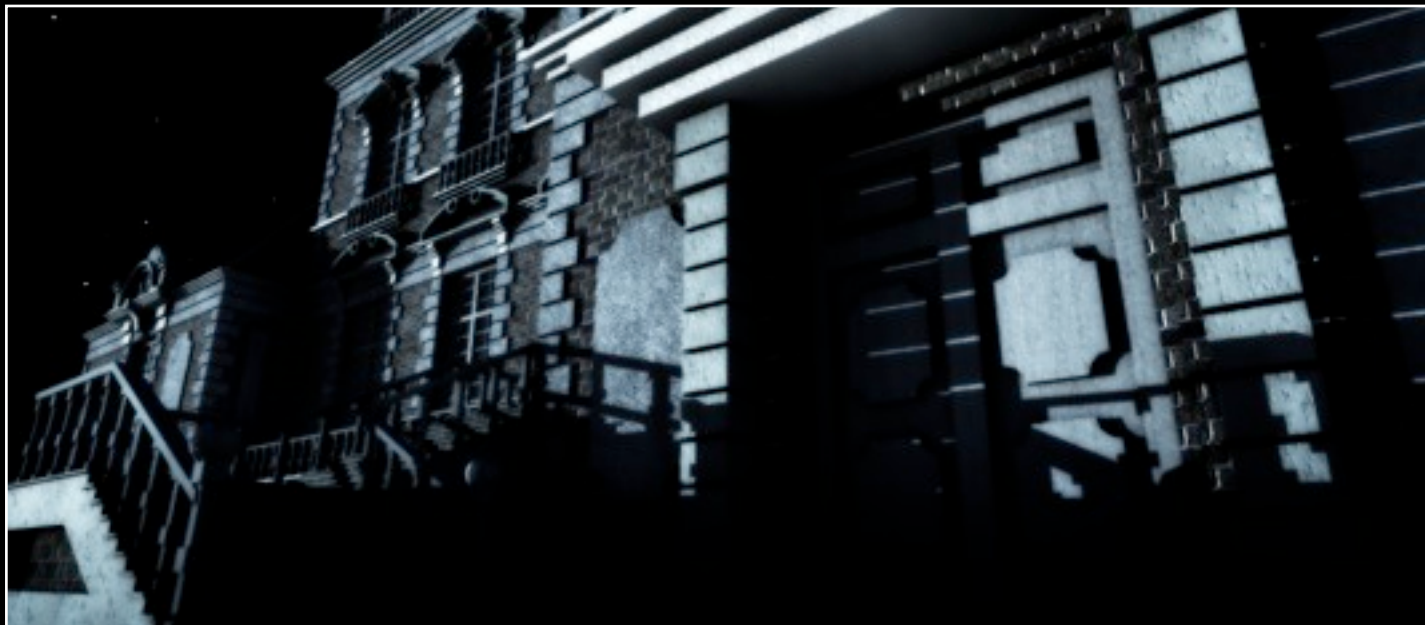
The front door of the mansion.