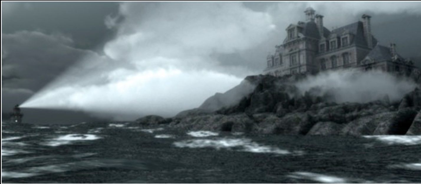
A wide shot of the mansion on the cliffs, illuminated by the beam of the nearby lighthouse.