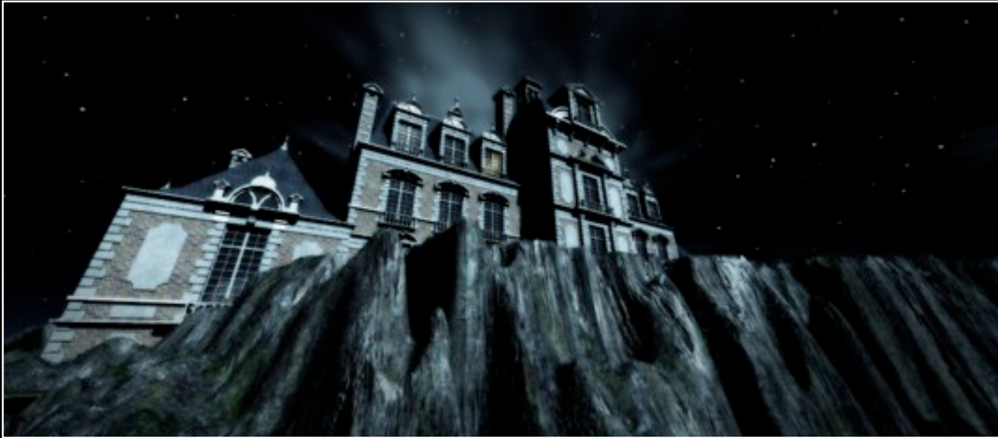
The house from the bottom of the cliffs.